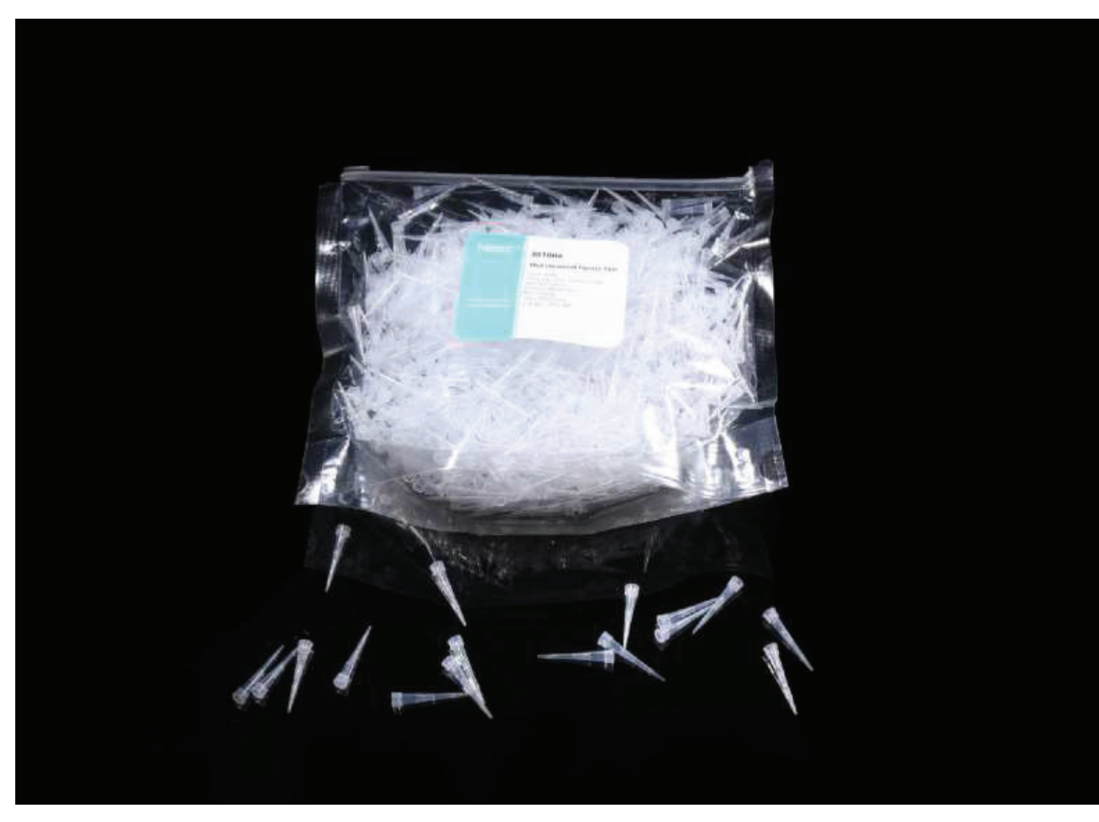
Sample Storage and Handling